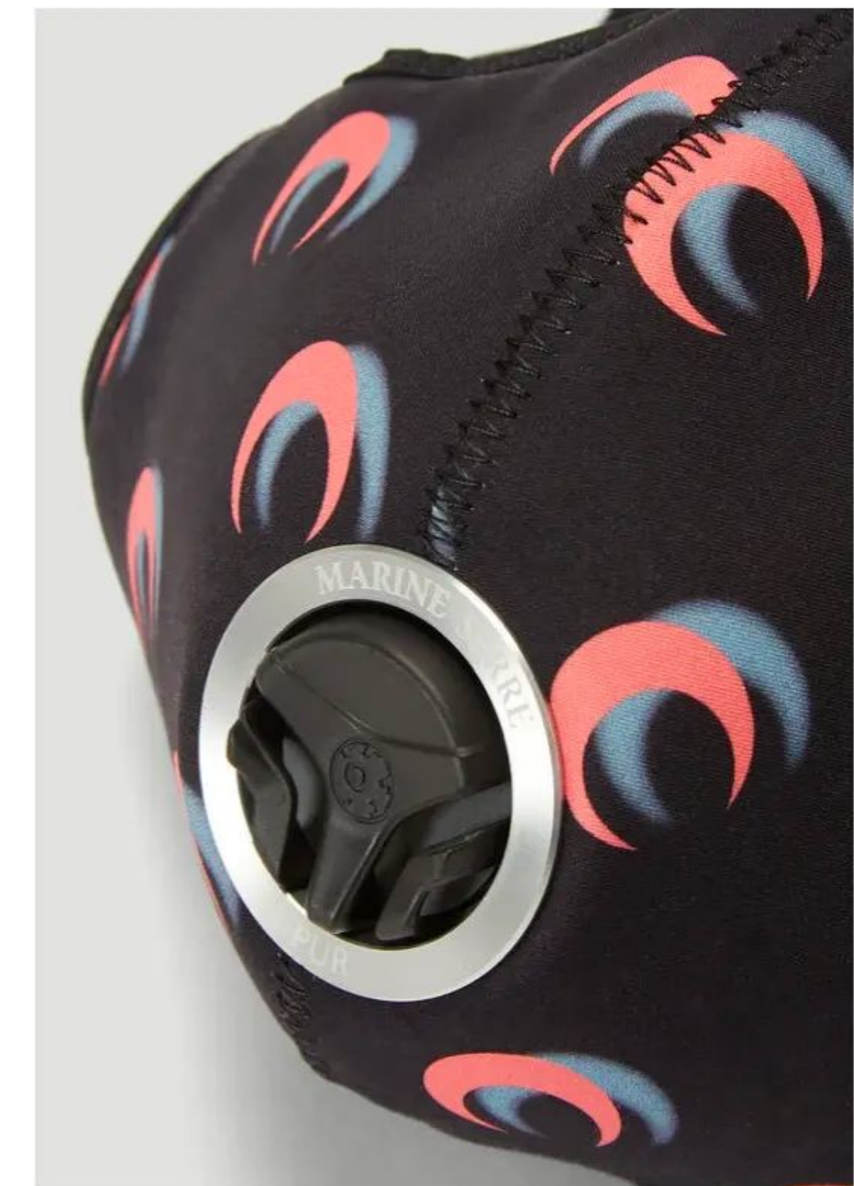
R-PUR x Marine Serre – Paris Fashion Week, February 2019